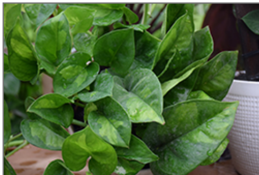
Golden Pothos foliage

When grown indoors, Golden Pothos can be expected to grow to be about 5 feet tall at maturity, with a spread of 24 inches. It grows at a fast rate, and under ideal conditions can be expected to live for approximately 10 years. This houseplant performs well in both bright or indirect sunlight and strong artificial light, and can therefore be situated in almost any well-lit room or location. It does best in average to evenly moist soil, but will not tolerate standing water. The surface of the soil shouldn't be allowed to dry out completely, and so you should expect to water this plant once and possibly even twice each week. Be aware that your particular watering schedule may vary depending on its location in the room, the pot size, plant size and other conditions; if in doubt, ask one of our experts in the store for advice. It will benefit from a regular feeding with a general-purpose fertilizer with every second or third watering. It is not particular as to soil type or pH; an average potting soil should work just fine. Be warned that parts of this plant are known to be toxic to humans and animals, so special care should be exercised if growing it around children and pets.