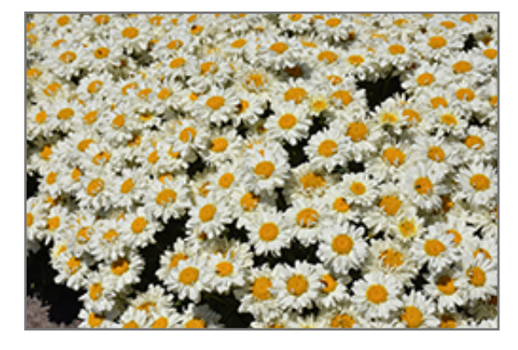
Adorable Shasta Daisy flowers

Adorable Shasta Daisy is recommended for the following landscape applications;