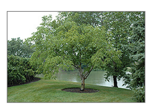
Lake English Walnut

A very large shade tree which produces copious yeilds of large thin-shelled nuts of very good quality and excellent flavor; one of the hardiest varieties for the home orchard, attracts squirrels, can be somewhat messy