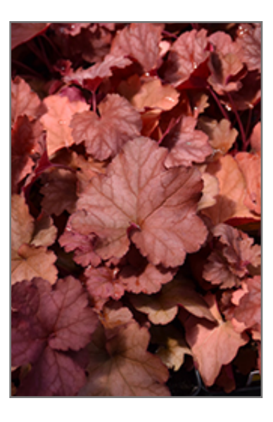
Tayberry Coral Bells foliage

Magenta-red new leaves that mature to orange shades; a tight, low growing mound that features spikes of small white blooms in late spring to early summer; suitable for cutting; drought tolerant once established; low maintenance