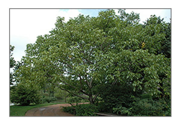
Hansen English Walnut

Aside from its primary use as an edible, Hansen English Walnut is sutiable for the following landscape applications;