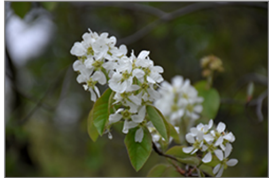
Saskatoon flowers

Saskatoon is a multi-stemmed deciduous shrub with an upright spreading habit of growth. Its relatively fine texture sets it apart from other landscape plants with less refined foliage.