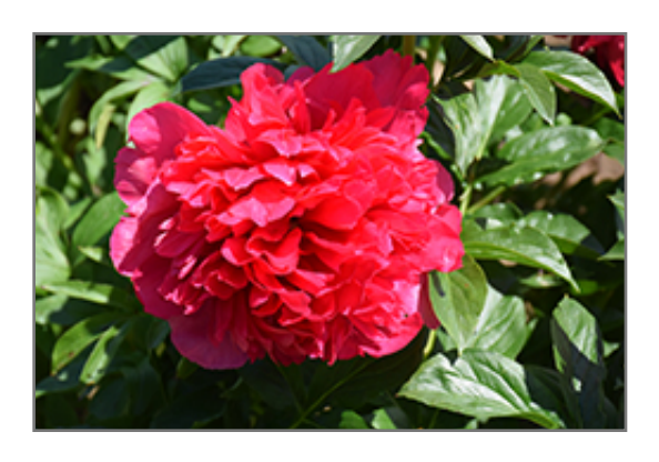
Command Performance Peony flowers

A stunning and eye catching selection featuring extra large, fully double cherry red blooms that transform with age, fading to shades of pink and finishing off in salmon and cream tones; excellent quality for fresh cut flower arrangements