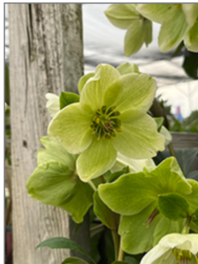
HGC Ice N' Roses White Hellebore flowers