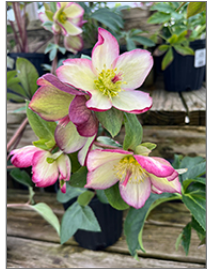
HGC Ice N' Roses Dark Picotee Hellebore flowers