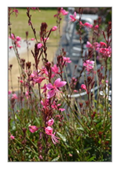
Steffi Dark Rose Gaura flowers

This is a relatively low maintenance plant, and is best cleaned up in early spring before it resumes active growth for the season. It is a good choice for attracting bees and butterflies to your yard, but is not particularly attractive to deer who tend to leave it alone in favor of tastier treats. It has no significant negative characteristics.