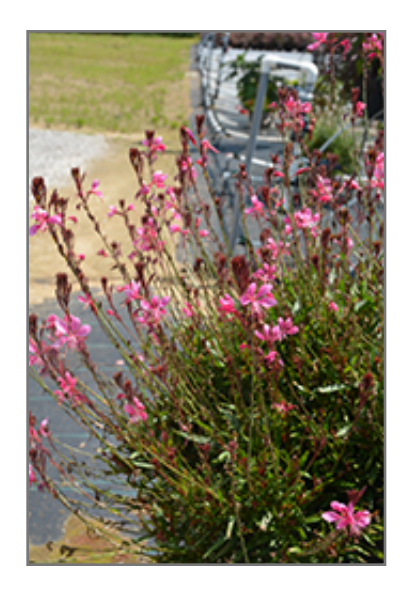
Steffi Dark Rose Gaura in bloom