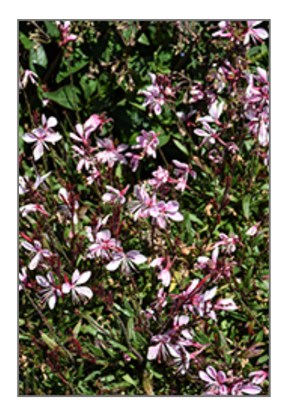
Steffi Blush Pink Gaura flowers