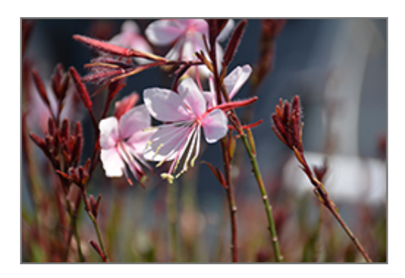
Steffi Blush Pink Gaura flowers

This is a relatively low maintenance plant, and is best cleaned up in early spring before it resumes active growth for the season. It is a good choice for attracting bees and butterflies to your yard, but is not particularly attractive to deer who tend to leave it alone in favor of tastier treats. It has no significant negative characteristics.