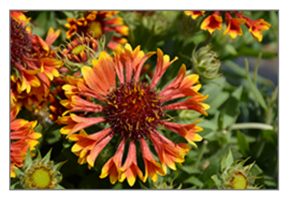
SpinTop Mariachi Copper Sun Blanket Flower flowers

SpinTop Mariachi Copper Sun Blanket Flower has masses of beautiful semi-double coppery-bronze daisy flowers with orange overtones, burgundy eyes and yellow tips at the ends of the stems from late spring to early fall, which are most effective when planted in groupings. The flowers are excellent for cutting. Its tomentose narrow leaves remain grayish green in colour throughout the season.