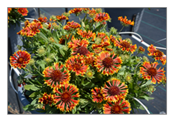
SpinTop Mariachi Copper Sun Blanket Flower in bloom