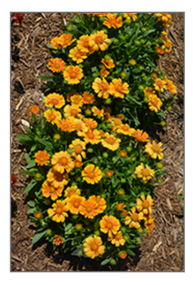
SpinTop Mango Blanket Flower in bloom