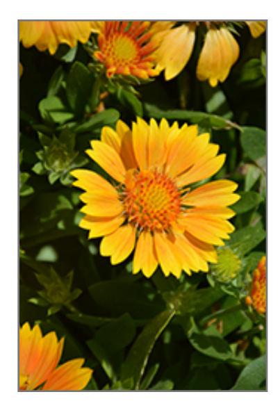
SpinTop Mango Blanket Flower flowers

SpinTop Mango Blanket Flower is recommended for the following landscape applications;