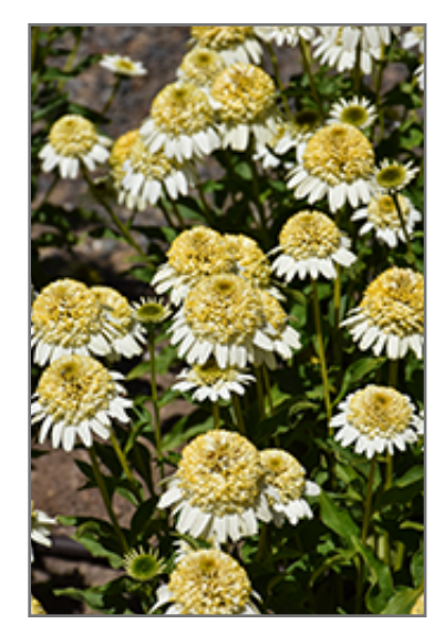
Sundial Zenith Coneflower flowers