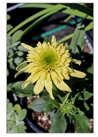
Sundial Zenith Coneflower flowers

Sundial Zenith Coneflower is recommended for the following landscape applications;