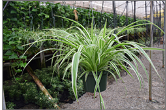
Reverse Variegated Spider Plant in full

When grown indoors, Reverse Variegated Spider Plant can be expected to grow to be about 24 inches tall at maturity, with a spread of 24 inches. It grows at a medium rate, and under ideal conditions can be expected to live for approximately 10 years. This houseplant performs well in both bright or indirect sunlight and strong artificial light, and can therefore be situated in almost any well-lit room or location. It is very adaptable to both dry and moist soil, but will not tolerate any standing water. The surface of the soil shouldn't be allowed to dry out completely, and so you should expect to water this plant once and possibly even twice each week. Be aware that your particular watering schedule may vary depending on its location in the room, the pot size, plant size and other conditions; if in doubt, ask one of our experts in the store for advice. It is not particular as to soil type or pH; an average potting soil should work just fine.