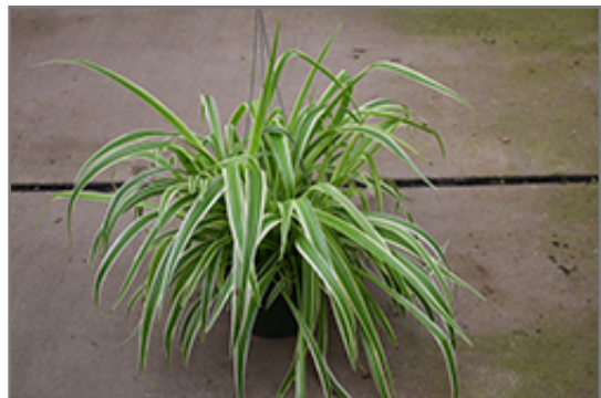
Reverse Variegated Spider Plant in full