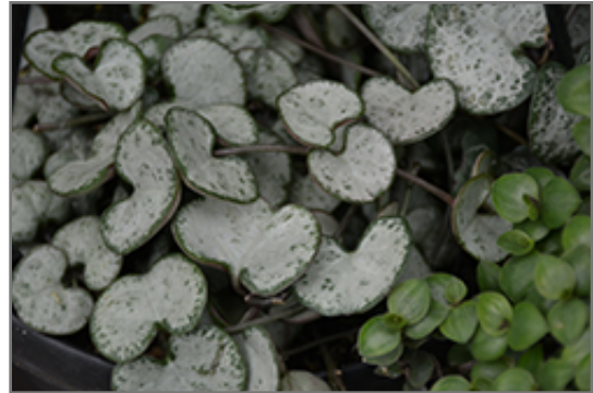
Silver String of Hearts foliage

When grown indoors, Silver String of Hearts can be expected to grow to be only 6 inches tall at maturity, with a spread of 12 inches. It grows at a medium rate, and under ideal conditions can be expected to live for approximately 10 years. This houseplant will do well in a location that gets either direct or indirect sunlight, although it will usually require a more brightly-lit environment than what artificial indoor lighting alone can provide. It prefers dry to average moisture levels with very well-drained soil, and may die if left in standing water for any length of time. This plant should be watered when the surface of the soil gets dry, and will need watering approximately once each week. Be aware that your particular watering schedule may vary depending on its location in the room, the pot size, plant size and other conditions; if in doubt, ask one of our experts in the store for advice. Like most succulents and cacti, it prefers to grow in poor soils and should therefore never be fertilized. It is not particular as to soil type or pH; an average potting soil should work just fine.