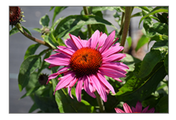
Prairie Splendor Compact Dark Rose Coneflower flowers

Prairie Splendor Compact Dark Rose Coneflower is recommended for the following landscape applications;