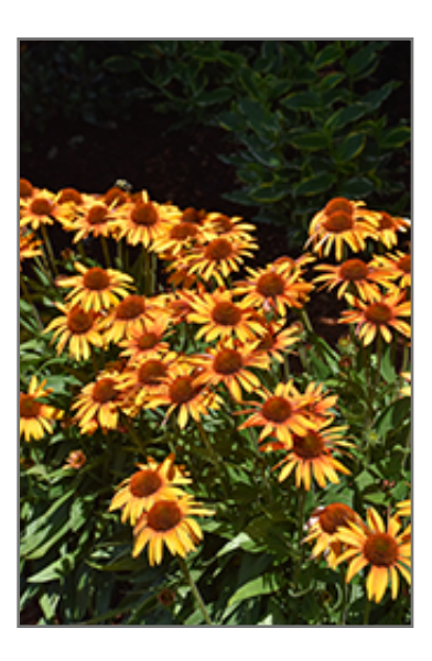
Prima Tiger Coneflower flowers

A beautiful dwarf variety featuring a short, clumping habit; gorgeous, fragrant, orange-red blooms with yellow tips from early summer to fall; an excellent selection for containers, borders or fresh-cut flower arrangement