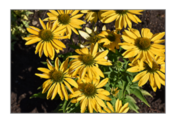
Prima Amarillo Coneflower flowers