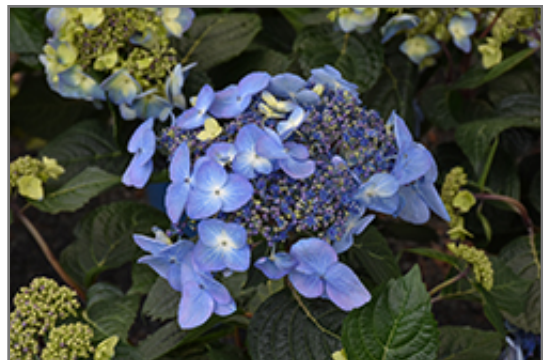
Pop Star Hydrangea flowers