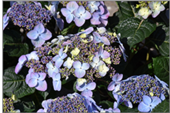
Pop Star Hydrangea flowers