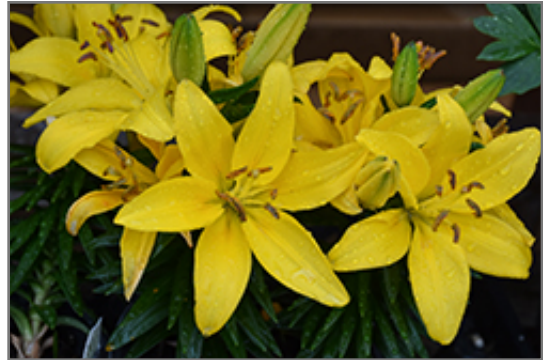
Lily Looks Tiny Ranger Lily flowers