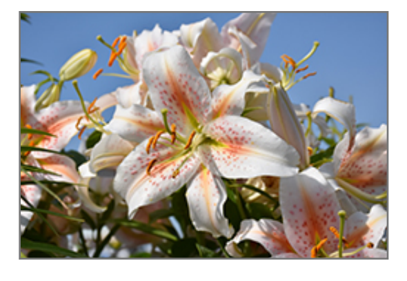
Salmon Star Lily flowers

Salmon Star Lily is an herbaceous perennial with an upright spreading habit of growth. Its medium texture blends into the garden, but can always be balanced by a couple of finer or coarser plants for an effective composition.