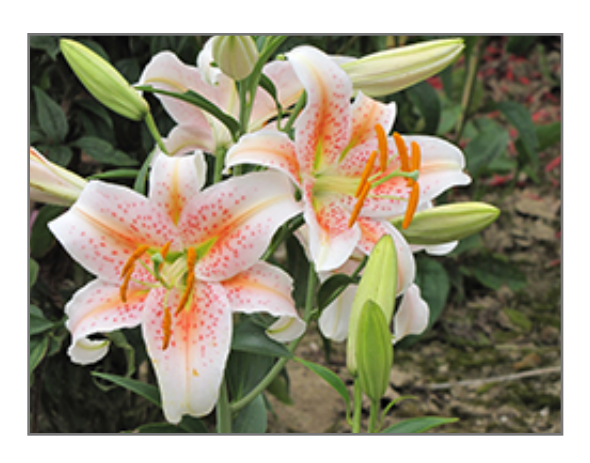
Salmon Star Lily flowers

This plant will require occasional maintenance and upkeep, and should be cut back in late fall in preparation for winter. It is a good choice for attracting bees and butterflies to your yard. Gardeners should be aware of the following characteristic(s) that may warrant special consideration;