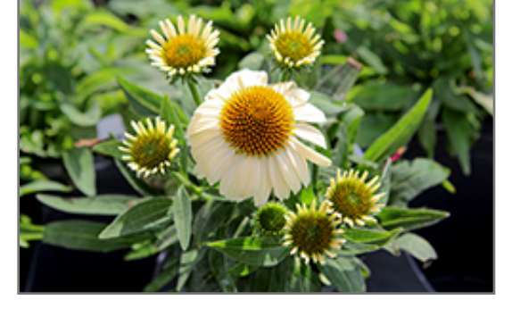
Mooodz Peace Coneflower flowers