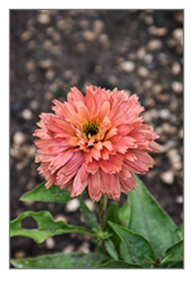
Fresco Apricot Coneflower flowers

Fresco Apricot Coneflower is recommended for the following landscape applications;