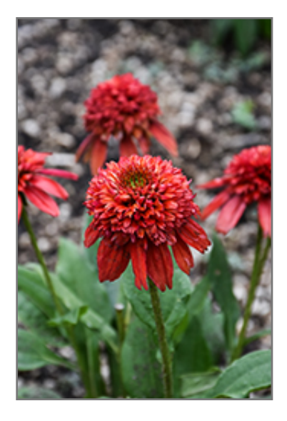
Double Scoop Orangeberry Deluxe Coneflower flowers