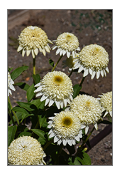
Cara Mia Sands Coneflower flowers