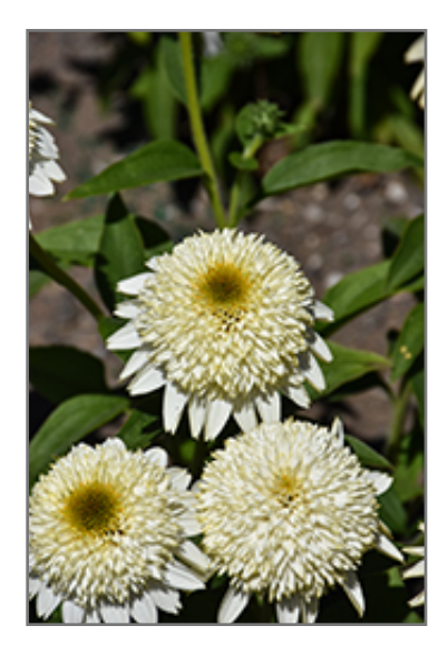
Cara Mia Sands Coneflower flowers

Cara Mia Sands Coneflower is recommended for the following landscape applications;