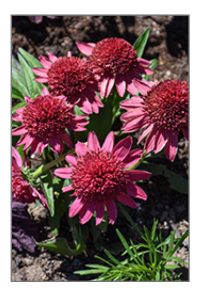
Cara Mia Carmine Coneflower flowers