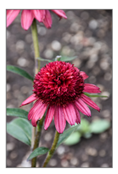
Cara Mia Carmine Coneflower flowers

Cara Mia Carmine Coneflower is recommended for the following landscape applications;