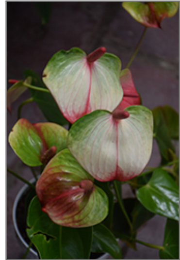
Elegance Anthurium flowers

This is an open herbaceous evergreen houseplant with an upright spreading habit of growth. Its relatively coarse texture stands it apart from other indoor plants with finer foliage. You may trim off the flower heads after they fade and die to encourage repeat blooming.