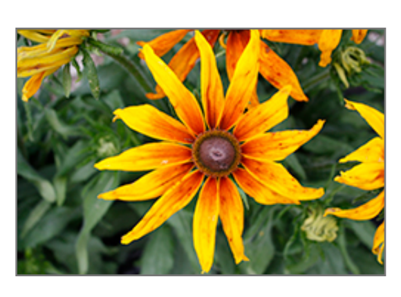
Summerina Sunchaser Echibeckia flowers

An intergeneric cross featuring the appearance of Rudbeckia, with the hardiness of Echinacea; long lasting, extra-large orange-yellow flowers with dark brown centers have a long blooming season; excellent for borders or containers; high disease resistance