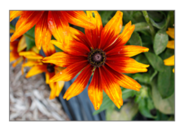
Summerina Sunbeat Echibeckia flowers

An intergeneric cross featuring the appearance of Rudbeckia, and the hardiness of Echinacea; stunning crimson-orange flowers with golden tips and dark brown centers have a long blooming season; very floriferous and excellent for borders or containers