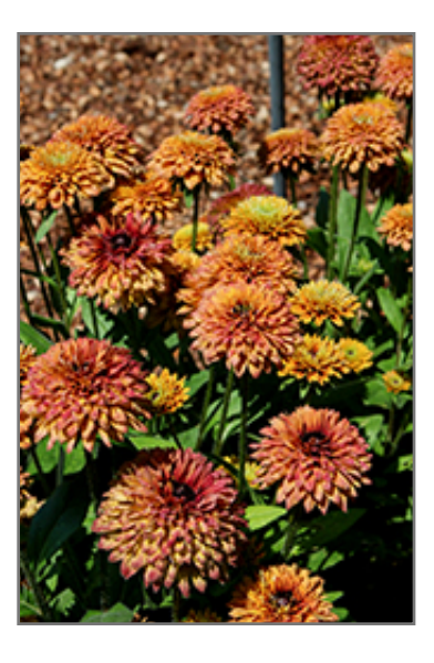
Summerina Glow Sugar Shake Echibeckia flowers

This is a relatively low maintenance plant, and should be cut back in late fall in preparation for winter. It is a good choice for attracting bees and butterflies to your yard, but is not particularly attractive to deer who tend to leave it alone in favor of tastier treats. It has no significant negative characteristics.