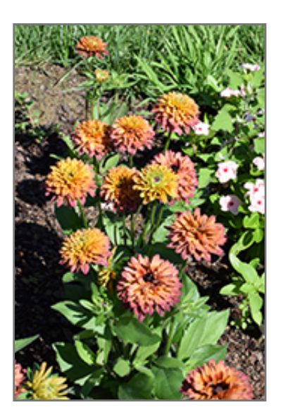
Summerina Glow Sugar Shake Echibeckia flowers