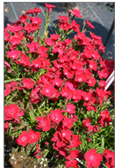
Beauties Tyra Pinks flowers