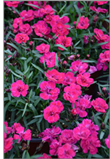
Beauties Tiiu Pinks flowers

Beauties Tiiu Pinks is recommended for the following landscape applications;