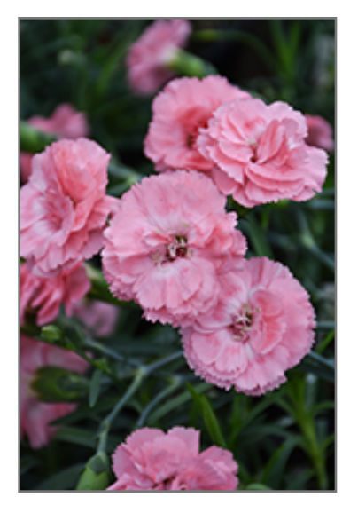
Scent First Tall Romance Pinks flowers

Scent First Tall Romance Pinks is recommended for the following landscape applications;