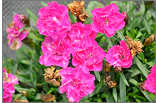
Beauties Melinda Pinks flowers

This is a relatively low maintenance plant, and is best cleaned up in early spring before it resumes active growth for the season. It is a good choice for attracting bees and butterflies to your yard, but is not particularly attractive to deer who tend to leave it alone in favor of tastier treats. It has no significant negative characteristics.