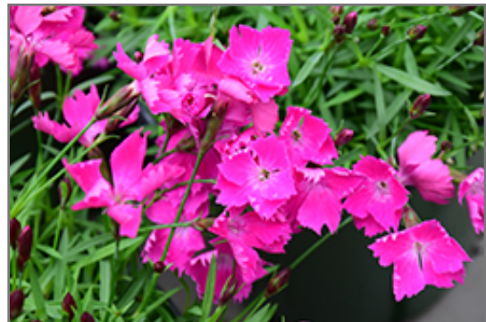
Beauties Kahori Pinks flowers