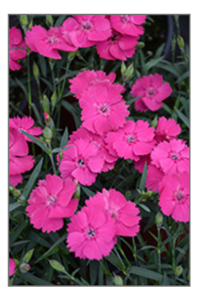
Mad Magenta Pinks flowers

An upright, mounding selection presenting vivid magenta pink flowers above attractive blue-green foliage; great for flower arrangements; deadhead to rebloom; pair up with summer blooming perennials and annuals to time a continued flower display