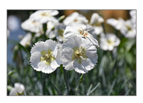
American Pie Key Lime Pie Pinks flowers

Stunning, beautifully scented frilly flowers are white, with unusual chartreuse centers, above lush mounds of fine foliage; vigorous, with excellent garden performance; sturdy stems are great for flower arrangements; deadhead to encourage reblooming;