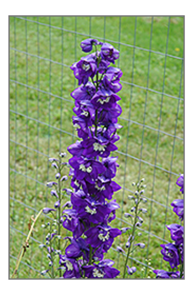
Magic Fountains Dark Blue White Bee Larkspur flowers