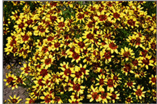
Firefly Tickseed flowers

Firefly Tickseed is recommended for the following landscape applications;