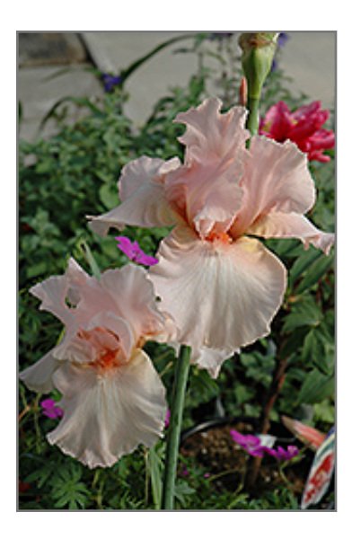
Beverly Sills Iris flowers

Beverly Sills Iris features bold salmon flag-like flowers with salmon falls at the ends of the stems in mid spring. The flowers are excellent for cutting. Its sword-like leaves remain green in colour throughout the season.