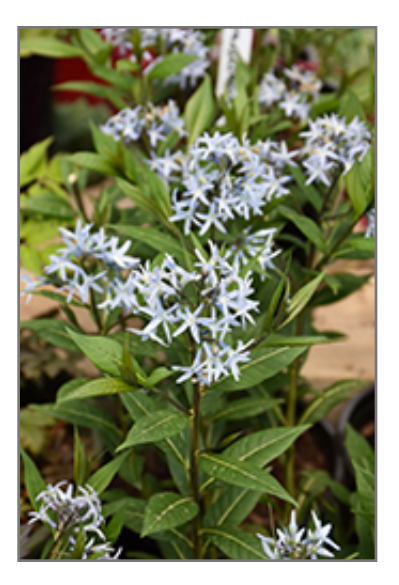
Starstruck Blue Star flowers

Star shaped, sky blue flowers in terminal clusters appear in late spring over vibrant green leaves with lighter midribs; beautiful fall color in tones of yellow-gold with orange highlights; great for borders, mixed beds, or a native garden