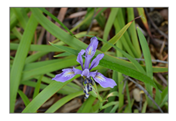
Beachhead Iris flowers