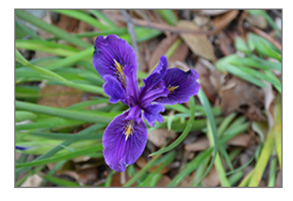
Beachhead Iris flowers