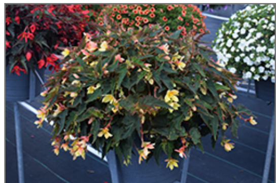
Mistral Yellow Begonia in bloom