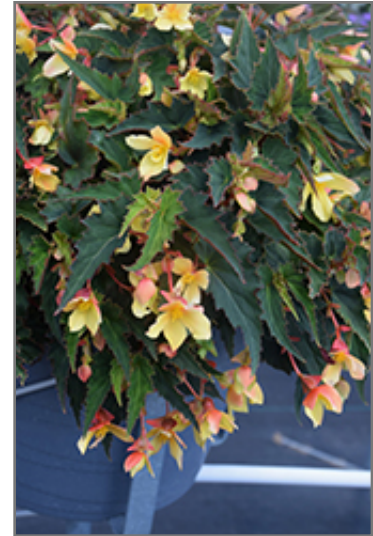
Mistral Yellow Begonia flowers