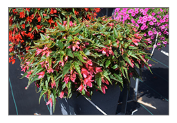
Mistral Pink Begonia in bloom