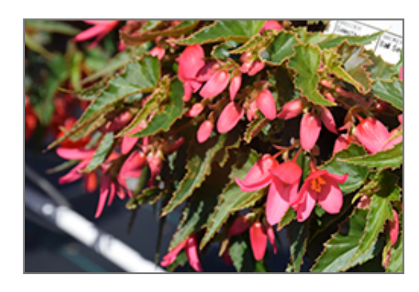
Mistral Pink Begonia flowers