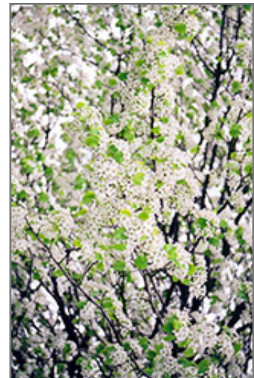
Bradford Ornamental Pear flowers