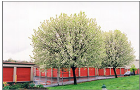
Bradford Ornamental Pear in bloom