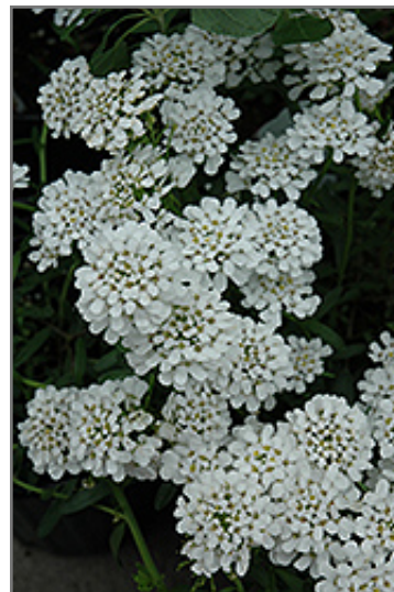
Alexander's White Candytuft flowers