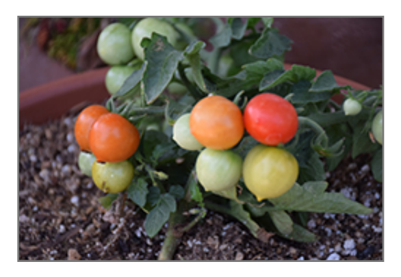
Kitchen Minis Red Velvet Tomato fruit

Kitchen Minis Red Velvet Tomato will grow to be about 8 inches tall at maturity, with a spread of 8 inches. When planted in rows, individual plants should be spaced approximately 8 inches apart. This fast-growing vegetable plant is an annual, which means that it will grow for one season in your garden and then die after producing a crop.