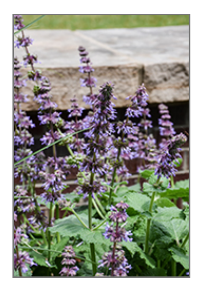
Lilac Sage flowers

Lilac Sage is an herbaceous perennial with an upright spreading habit of growth. Its medium texture blends into the garden, but can always be balanced by a couple of finer or coarser plants for an effective composition.