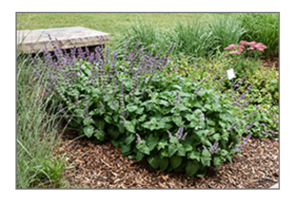
Lilac Sage in bloom