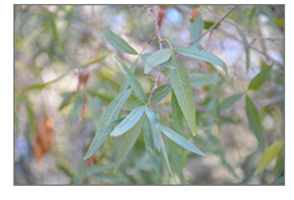
White Karee foliage

A large, upright evergreen shrub or small tree with weeping branchlets and a rounded canopy; willow-like foliage is dark green above and pale gray-green below; tiny green flowers in spring are followed by round red fruit; drought tolerant once established