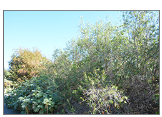
White Karee

White Karee is a dense multi-stemmed evergreen tree with a shapely form and gracefully arching branches. Its relatively fine texture sets it apart from other landscape plants with less refined foliage.